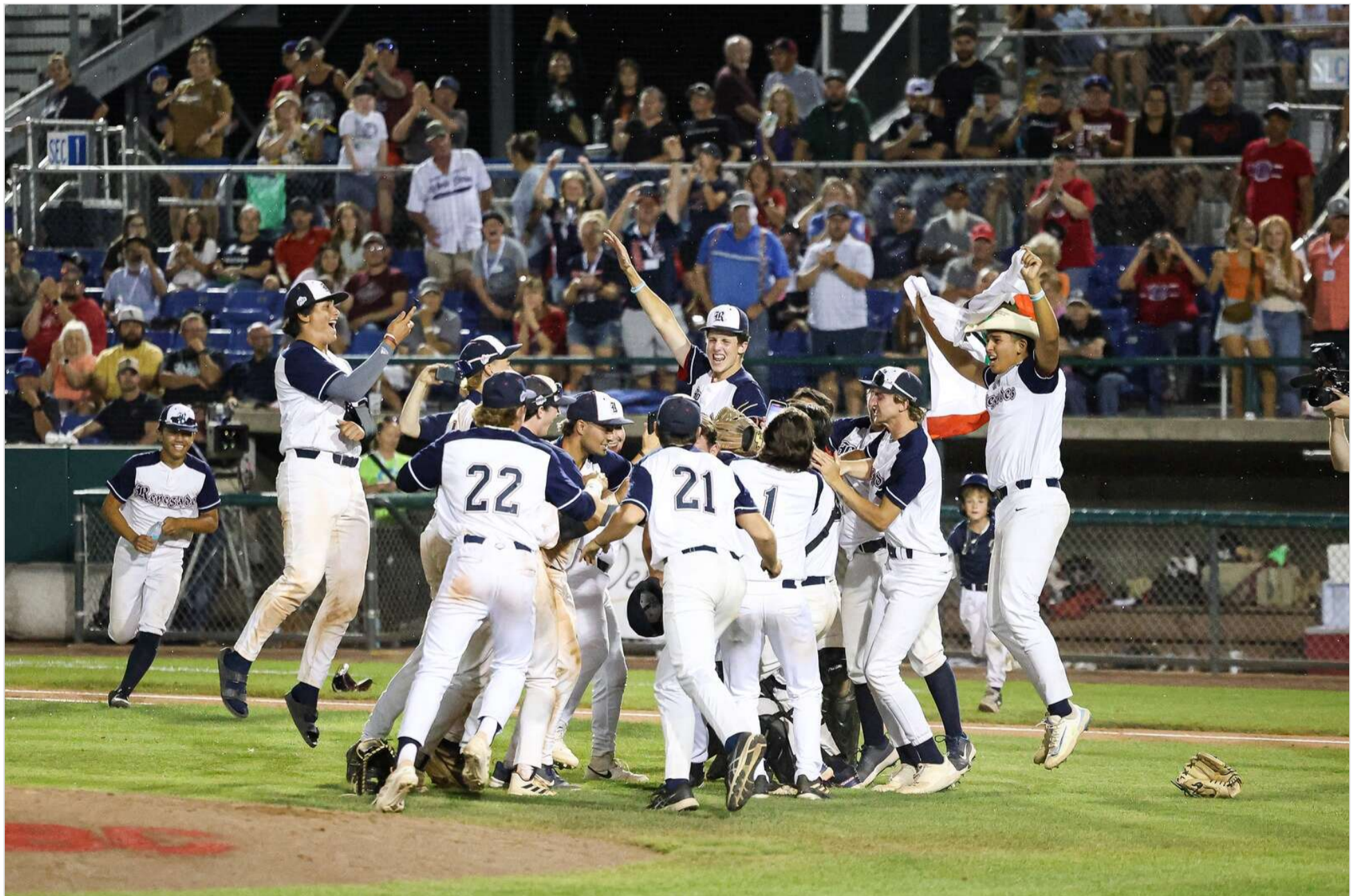
Southern California Renegades celebrate their Connie Mack World Series championship win after defeating Midland Baseball 6-0 on Friday at Ricketts Park.